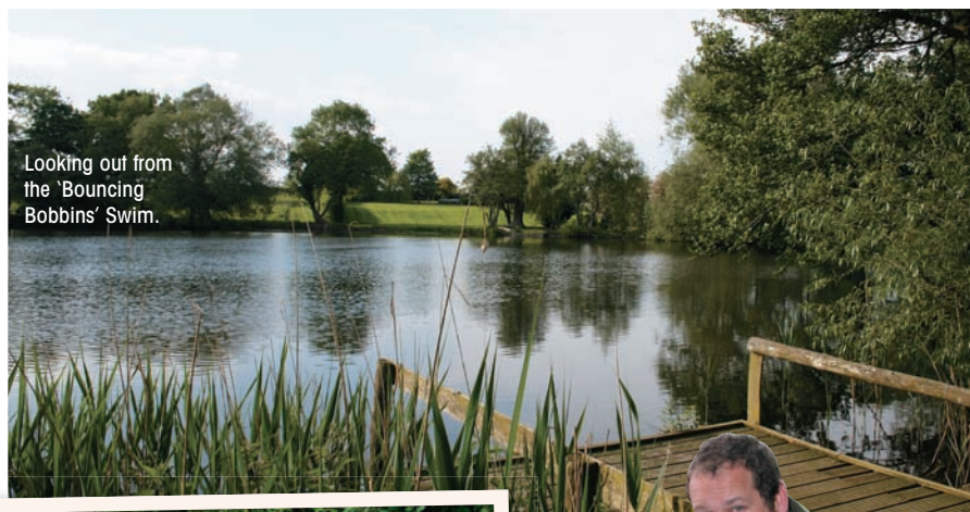
Looking out from the 'Bouncing Bobbins' Swim.

In the words of Simon Crow: "It's almost as good as Redmire, and it's certainly one of the best available waters in the country that is open to all."