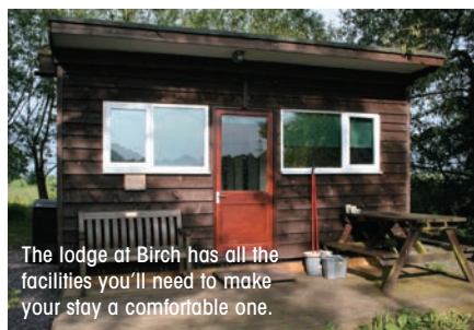
The lodge at Birch has all the facilities you'll need to make your stay a comfortable one.

There are now fish to upper-30s with a large number of 20s, backed up by mid-doubles. It is expected that the first 40lb carp will show its face this year. There is a boat provided for baiting up and bait boats are now allowed on the water. The fish are not easy to catch because over the years they've seen just about every type of rig and bait imaginable, from some of the best anglers around – but this only adds to the aura of the lake and when the fish do feed and are hooked, they fight like demons!